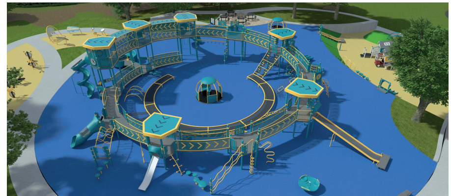
MAIN ROTARY PLAY STRUCTURE - OVERHEAD VIEW