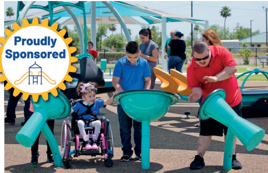
GOBLET DRUM, KUNDU DRUM, KETTLE DRUM, TONGUE DRUM

The arched design of the drums allows for easy roll up access for those using wheelchairs. It promotes eye-hand coordination, too