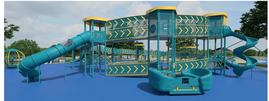
MAIN ROTARY PLAY STRUCTURE - GROUND LEVEL