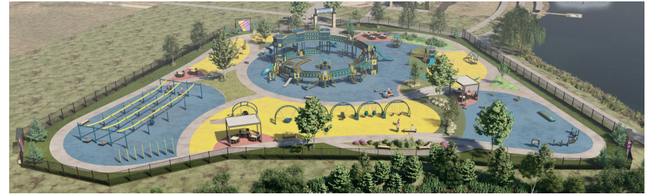
LARGE SIGN SPANNING THE PLAYGROUND ENTRANCE